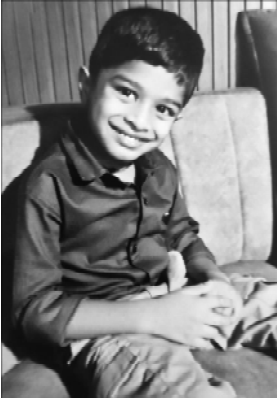
Best Wishes to Our Sona Bacha-