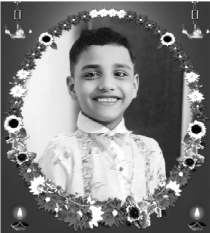
Late T. Vedhant

2 BHK Room available for rent at ABC Colony, Shadipur with 24 × 7 water supply at 2 nd Floor for Rs.10,000/- PM. Contact Ph. No. 9933213505, 8900903028